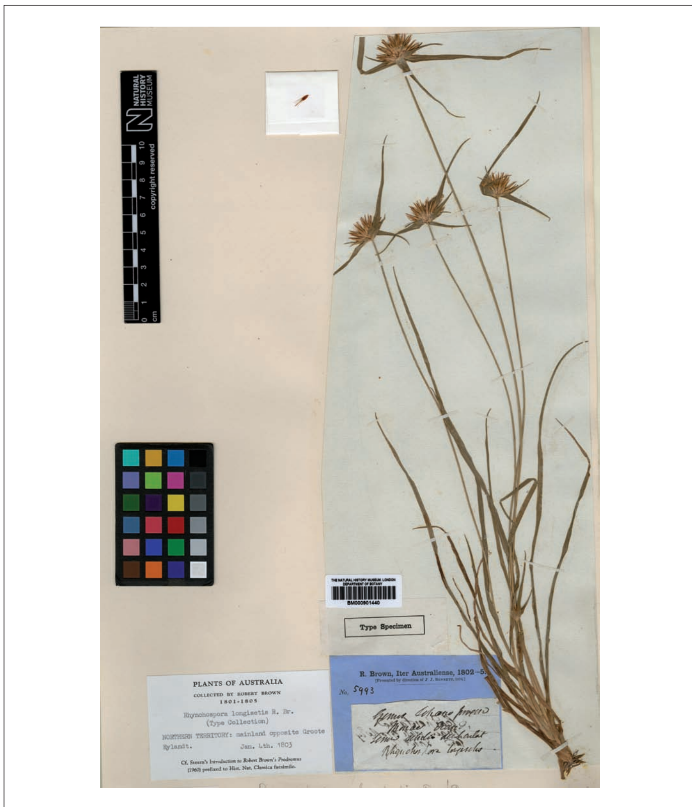
Fig. 2. – Lectotypus of Rhynchospora longisetis R. Br.

[Banks s.n., BM]