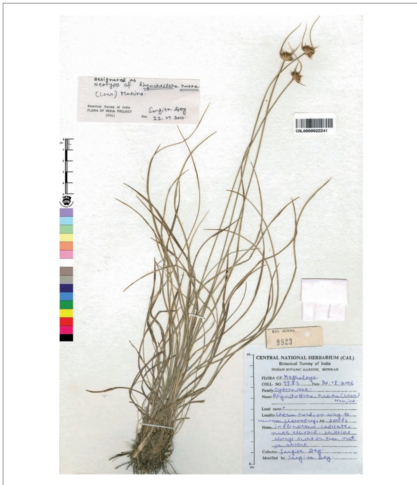
Fig. 3. – Neotypus of Rhynchospora rubra (Lour.) Makino.

[Sangita Dey 9923, CAL]