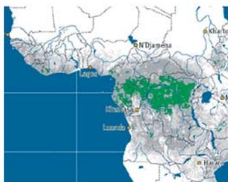
Democratic Republic of Congo